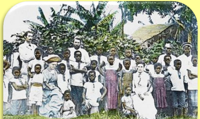
Congolese converts to Protestantism with white missionaries at the Congo-Balolo Mission, c.1889

So the natives devised a plan to slowly and secretly poison the missionaries and watch them die. One by one, children and adults became ill, died and were buried. Surely, to the missionaries it must have seemed that their efforts to share the gospel were dying too. But, in fact, it was when the native people saw how these missionaries died that they decided to believe their message. For, "As in the darkest night the stars shine brightest, so the most brilliant beams of God's glory are revealed in the deepest gloom." {ST, March 22, 1905 par. 8}