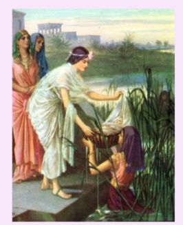
"Drawn out" SOEMS

The names of people in the Bible often have special meanings. Sometimes they even match the stories of the people. Can you figure out who these Bible people are by the meanings of their names and by unscrambling the letters in their names?