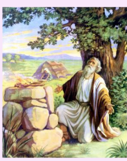
"Father of a multitude" AMABRHA