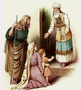
"Heard of God" MLEUSA