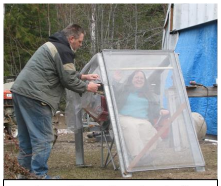
Improvising a "sun-chamber"

Although my own symptoms of EHS are mostly on the inside and not the outside like my daughter's (causing tiredness, pain, brain fog, and severe fluid retention sometimes even resulting in difficulty breathing, etc.) after being in signal—my inconvenience is just as real. Recently, when the signals from a mountaintop tower began trespassing into our off-grid lawn and garden area, we had to come up